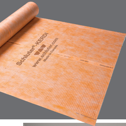
Schluter®-KERDI bonded waterproofing and vapor-retardant membrane