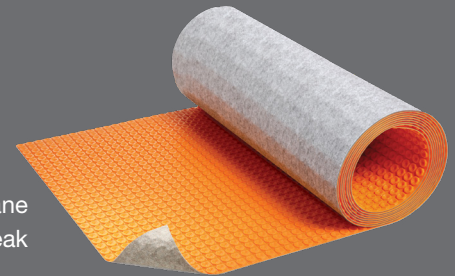
Schluter®-DITRA-HEAT-DUO uncoupling membrane with integrated sound control and thermal break